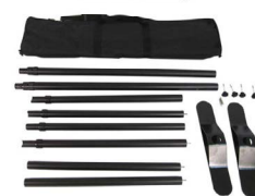
Telescoping Poles + Bases